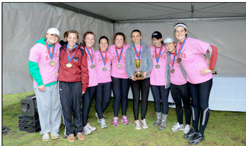
(left) The Freshman 8 took first place at the 2011 Atlantic 10 Championships, for SJU's first gold medal in that event since 2008.