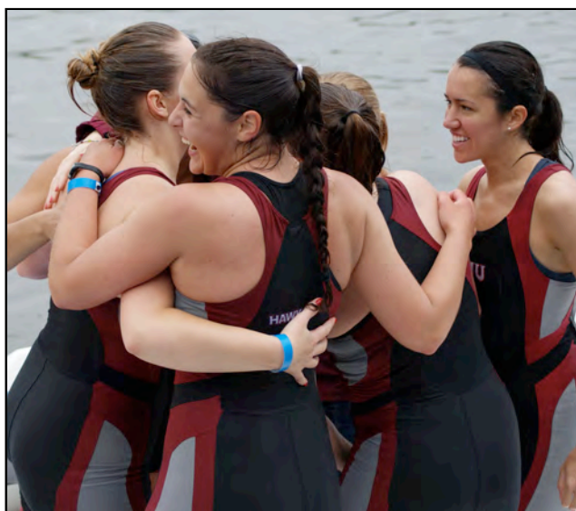
(left) The Second Varsity 8 crew celebrates its win in the 2011 Aberdeen Dad Vail Regatta, which was the first ever for SJU in that event.