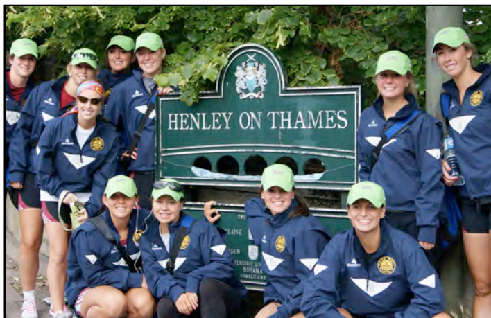
The Hawks have made two trips to the Henley Royal Regatta, with the most recent being in 2010.