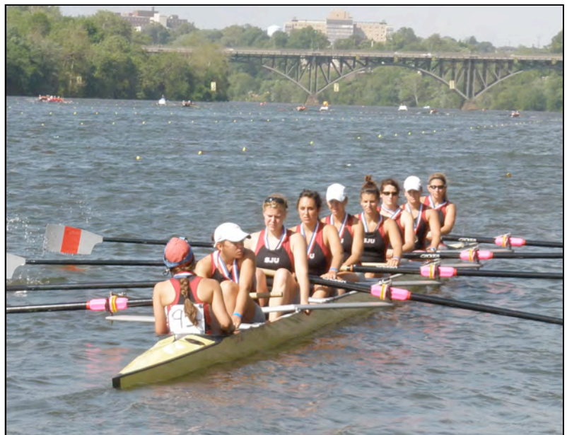
The Hawks advanced all of their eights to the Grand Finals at the 2010 Aberdeen Dad Vail Regatta. SJU owns the regatta record for reaching the Varsity 8 Grand Final for six consecutive years.